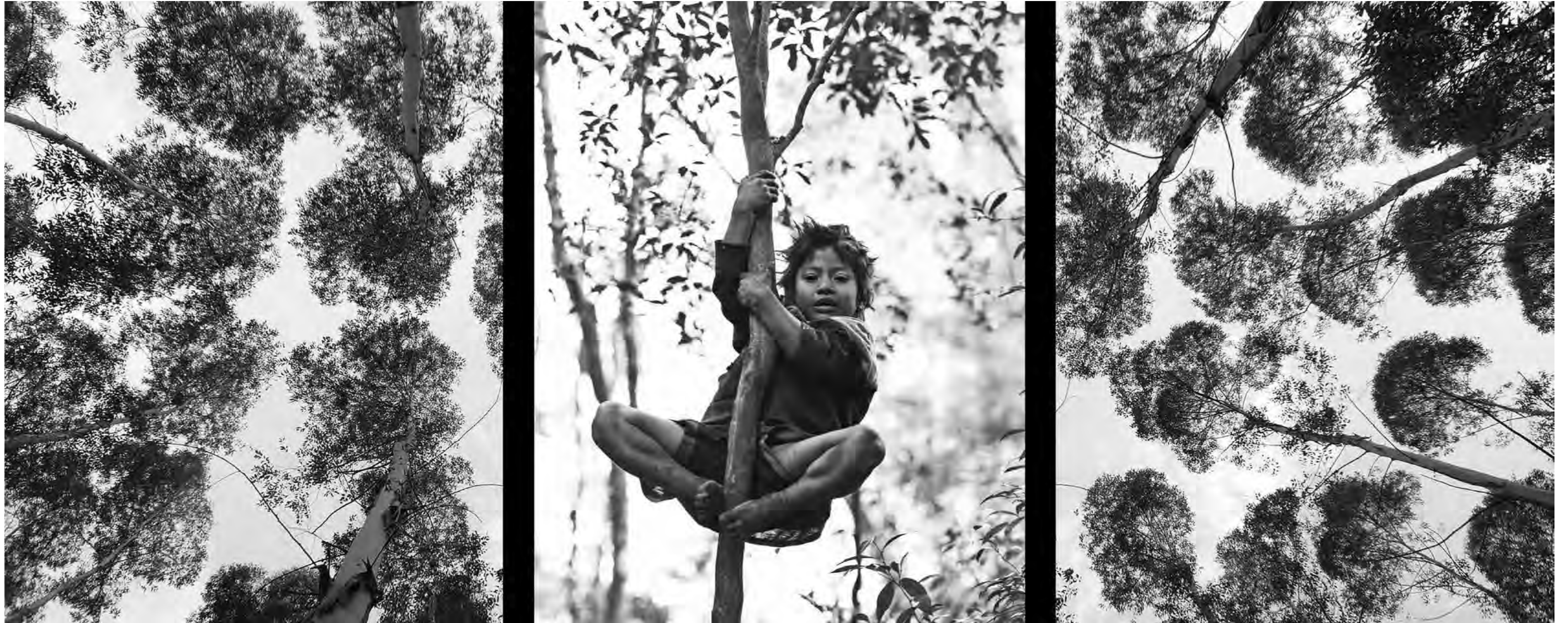
Argentina, Misiones, Guaranies, 1990-2010