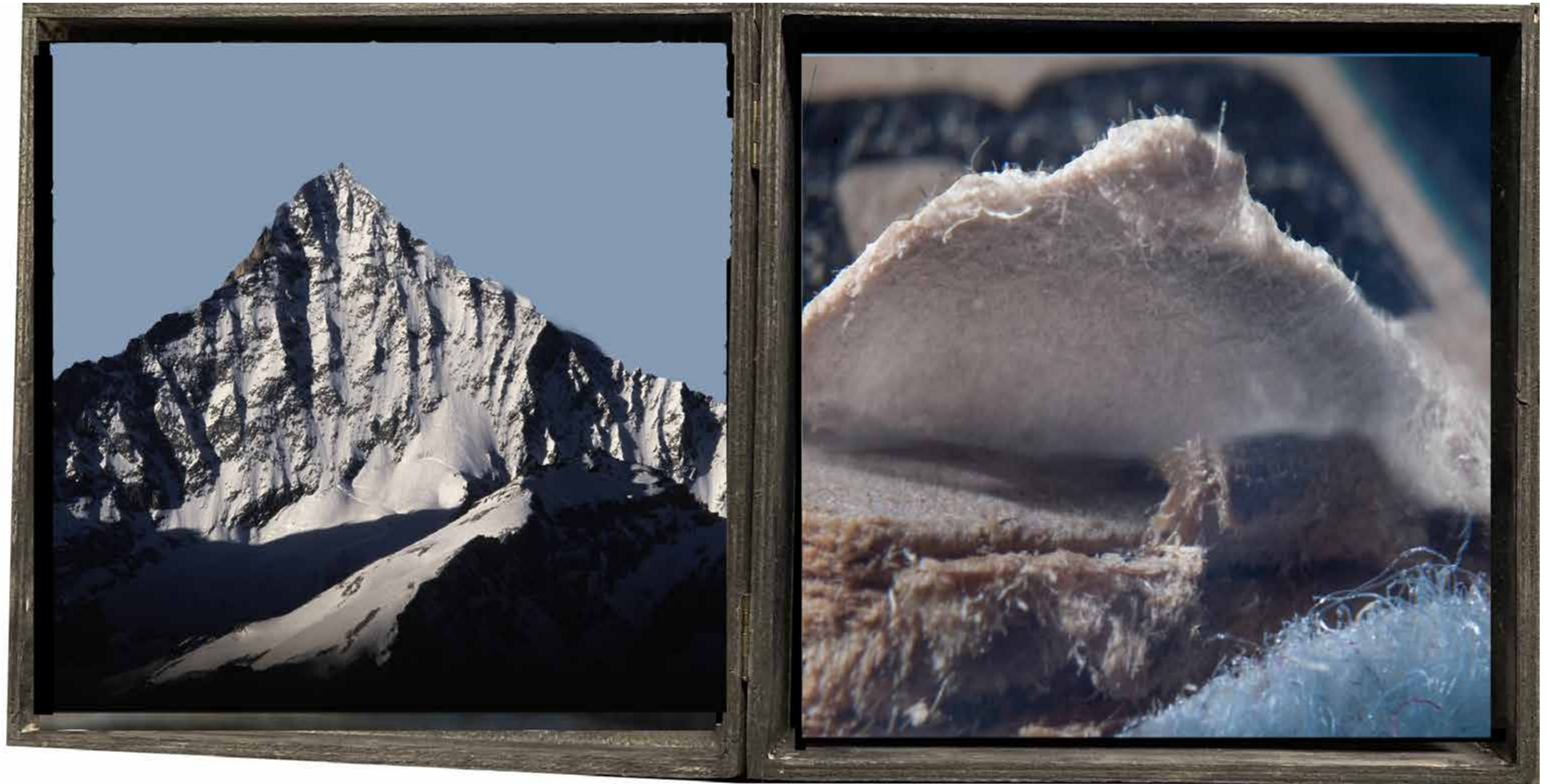
Diptych left real mountain of Saas Fee right 12 mm of second hand book, coast of the book