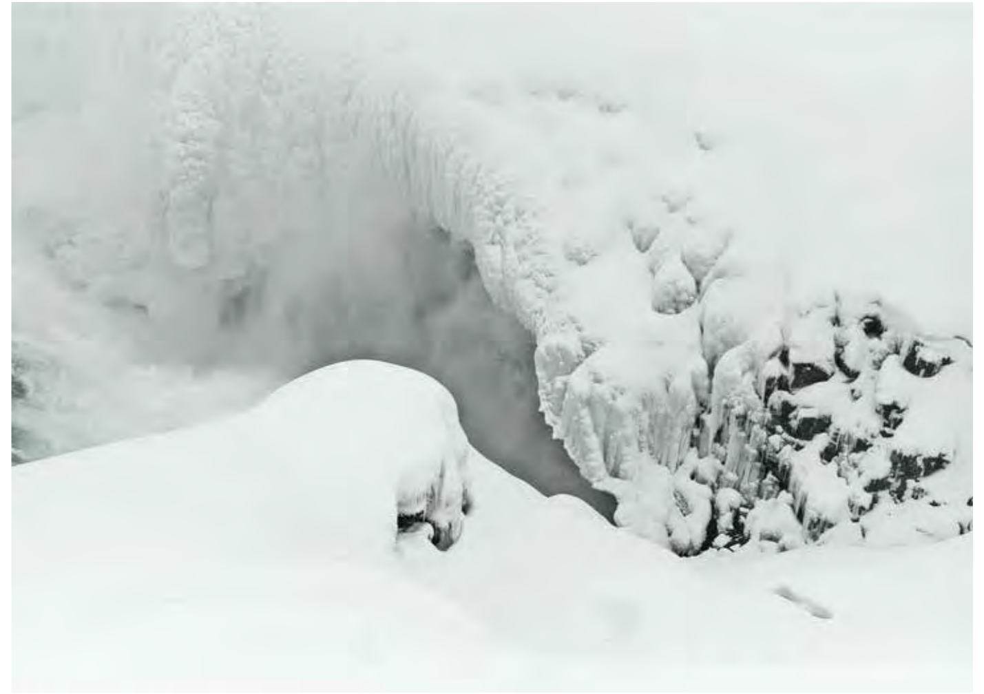
Iceland, Paradise and Hell, 2010