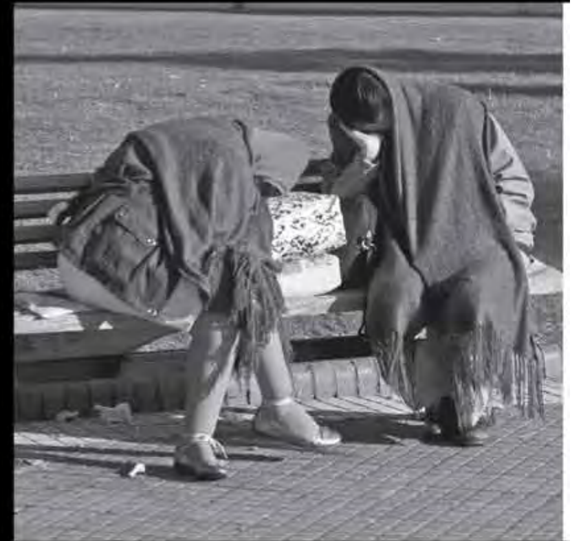
Buenos Aires, Cartoneros, 1987-2020