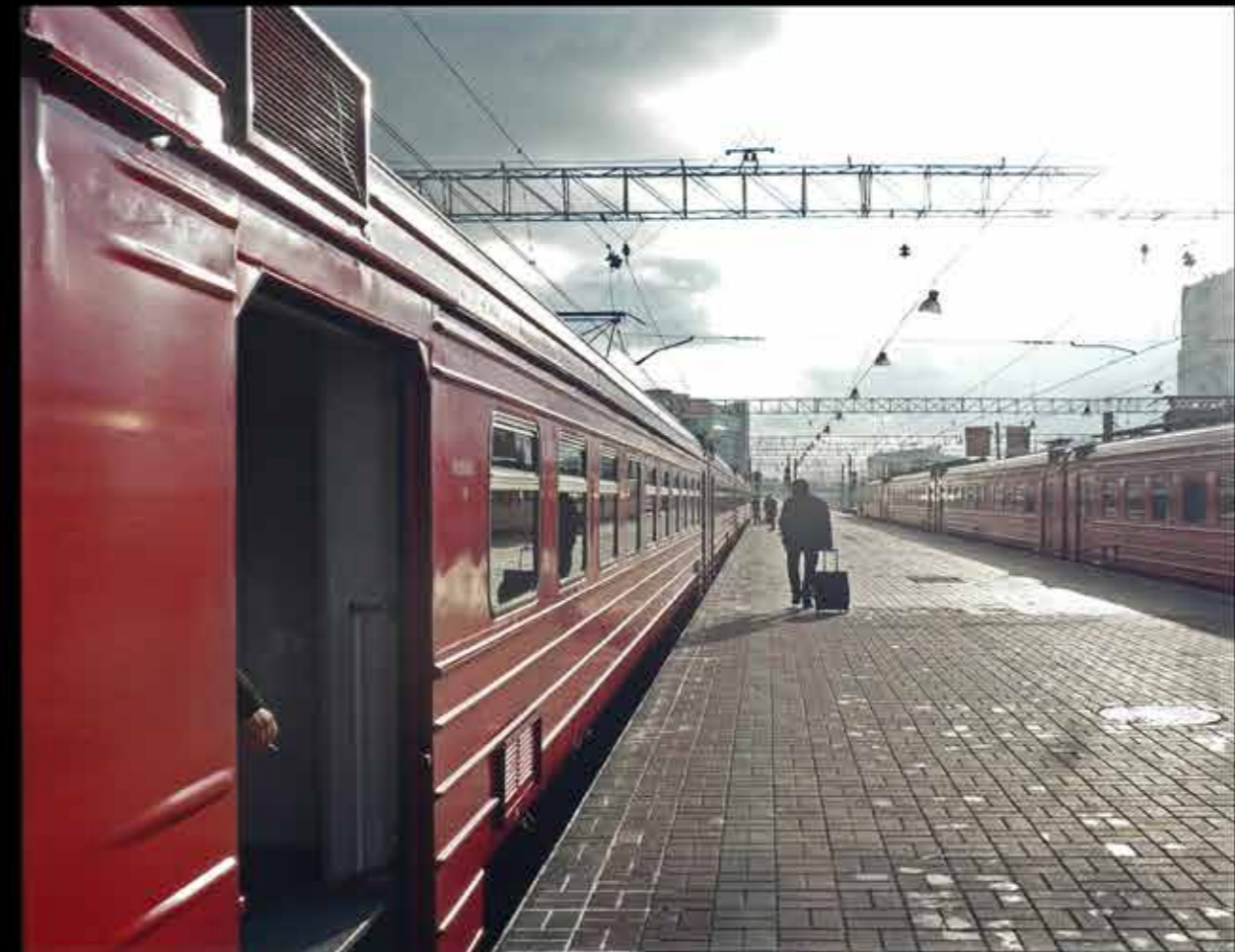
Moska Train Station 2005