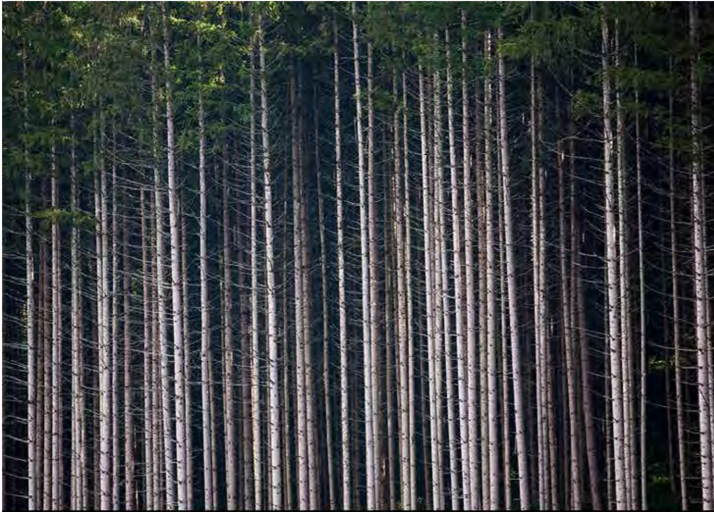
TYCH: FOREST GESAUSE PARK AUSTRIA AND MACRO OF A COAST OF A SECOND HAND RUSSIAN BO