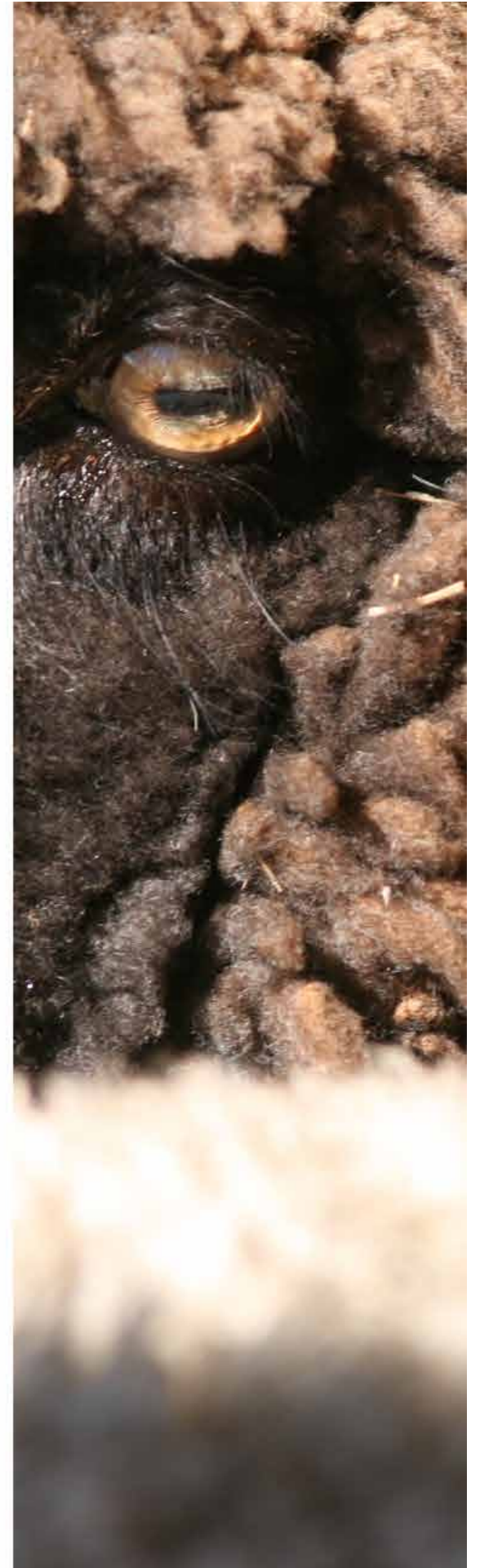
Argentina, Corrientes, Esquila 2005