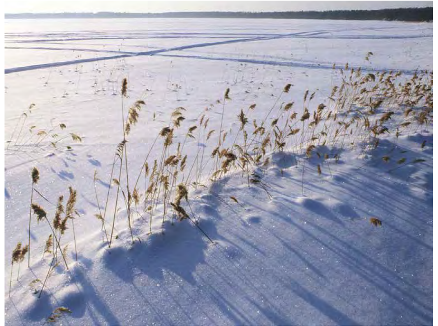
Karelia, Finland 1990-2000