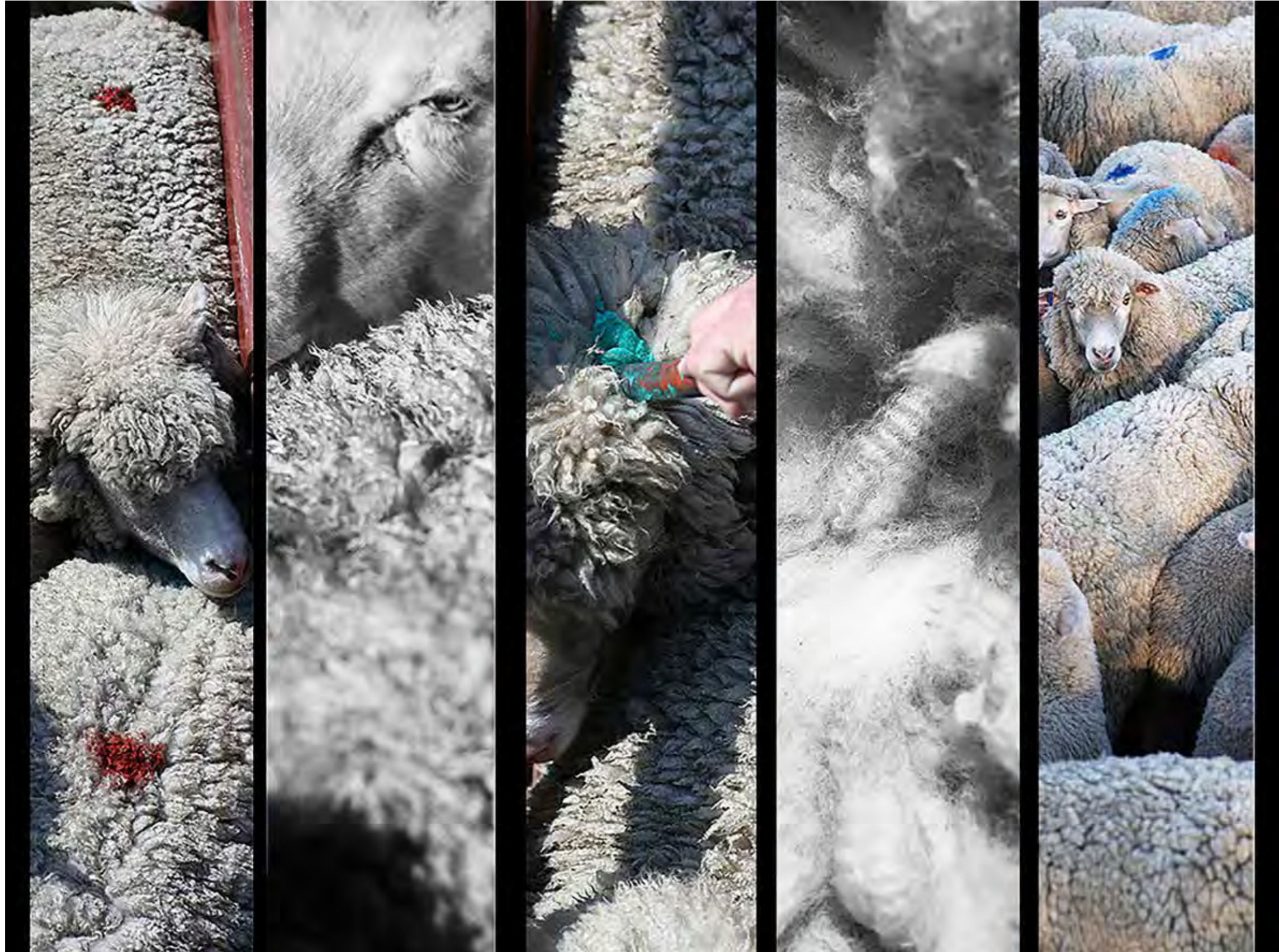
Argentina, Corrientes, Esquila 2006