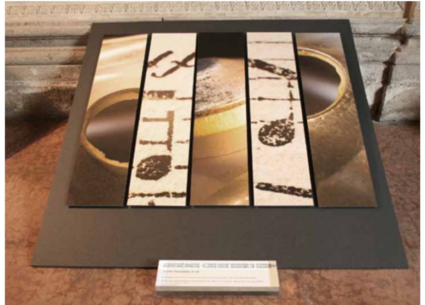
from exh Flatus Vocis polptych with original scores and anti- que instruments