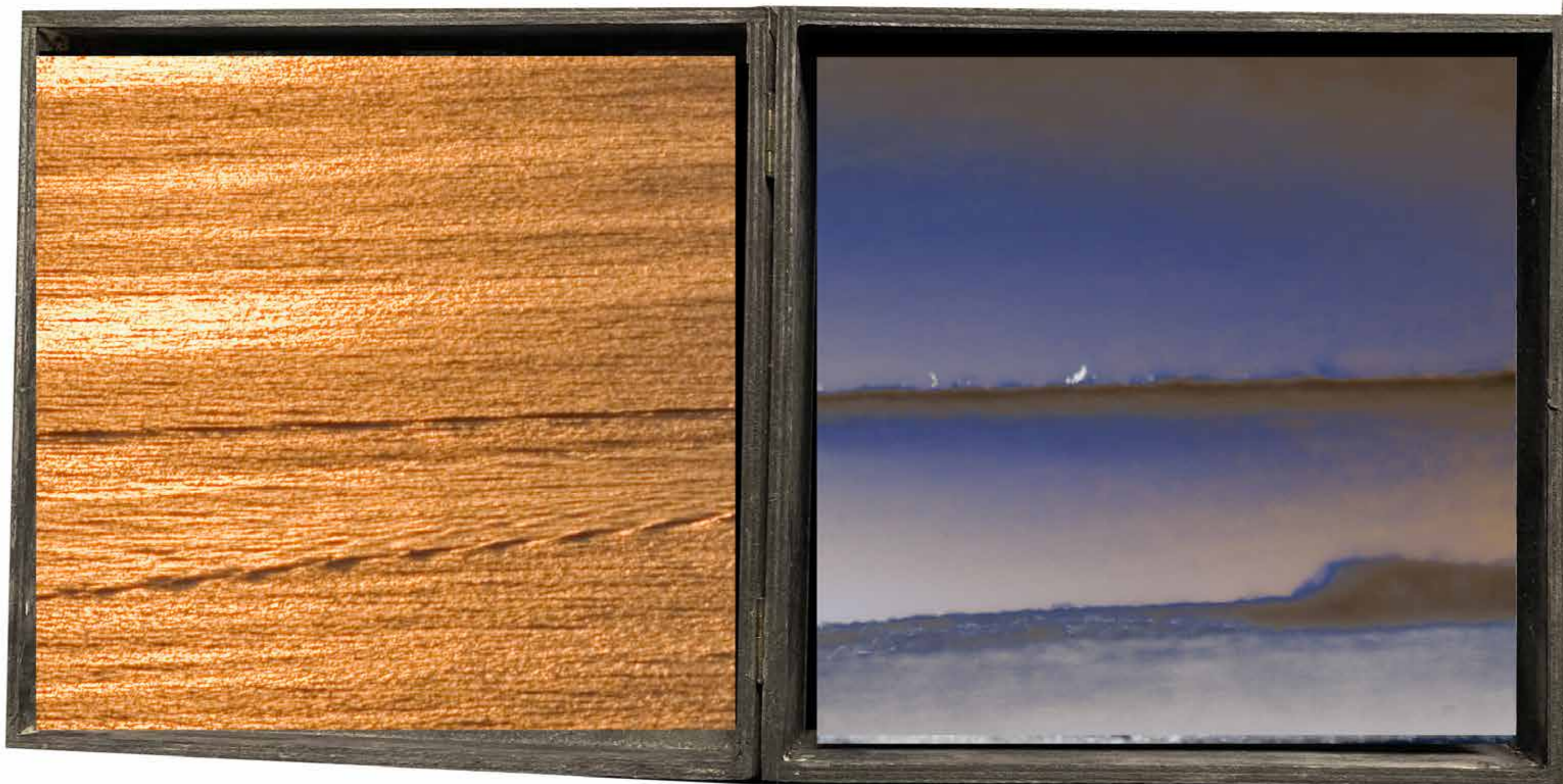
Mari in scatola dittico mare reale Tigullio a sx e a dx 12 mm di libro consumato (da Mare di pagine mia exh)