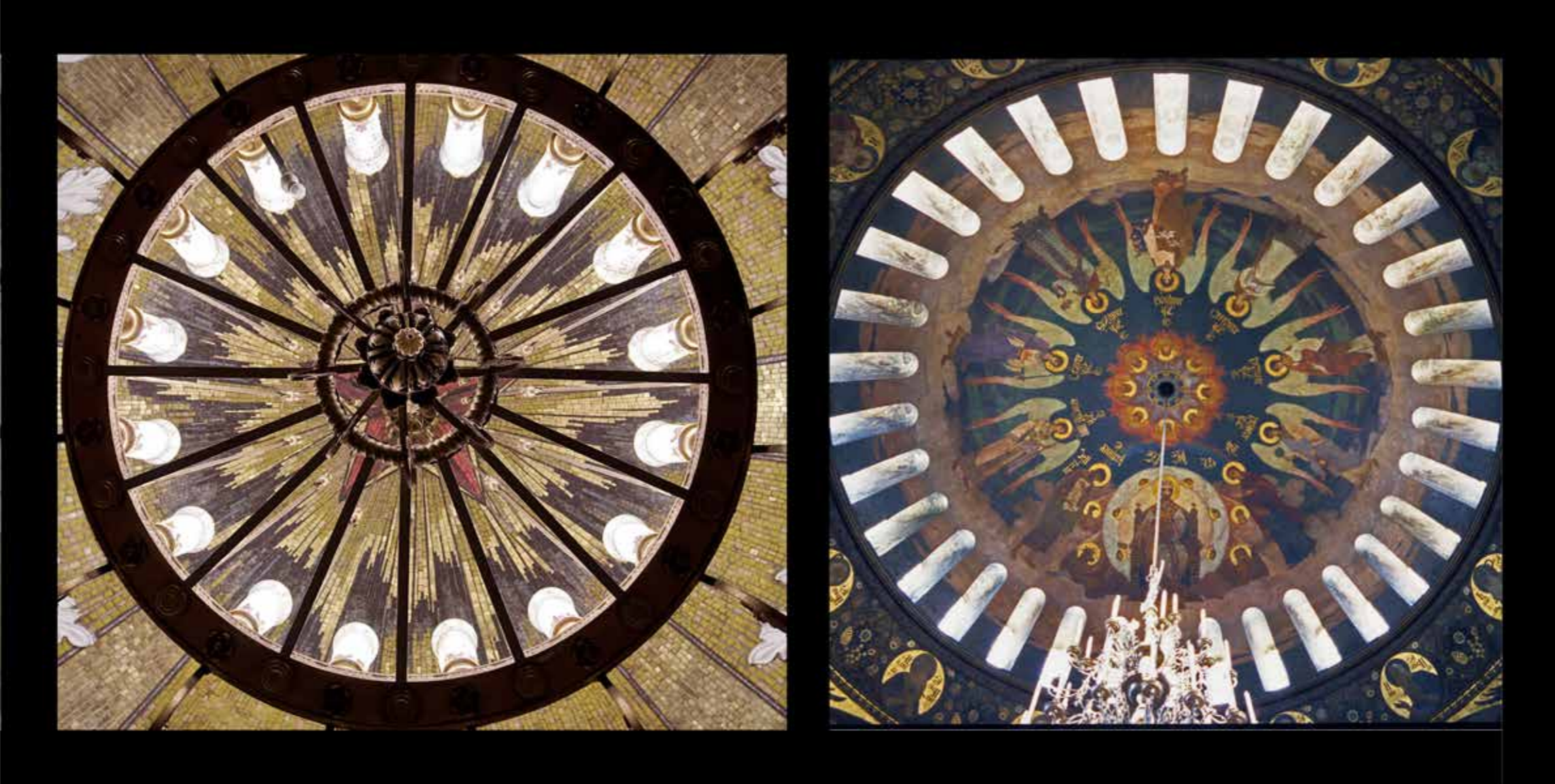
Two religion: soviet and orthodox Moskva metro station and Kiev Santa Sofia cathedral