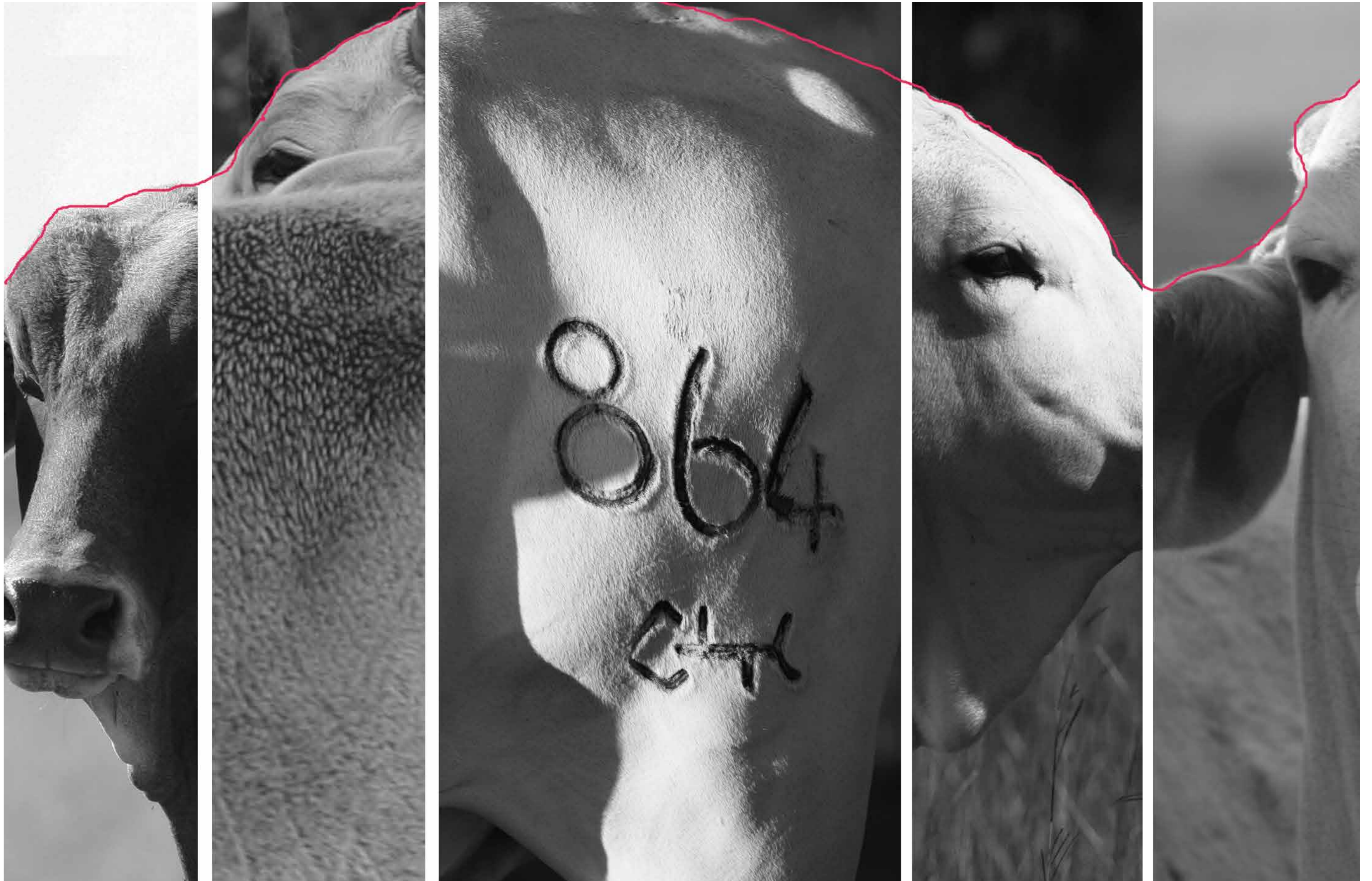
Argentina, Corrientes, cows