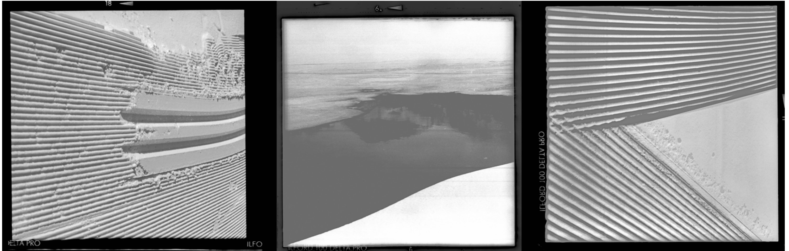
Triptych Snow Engadin 2012