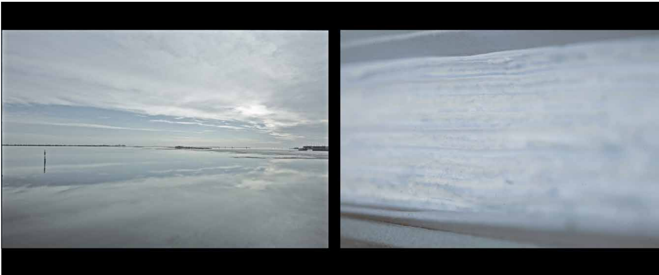
Lagune, dittico laguna reale di Marano a sx e a dx 12 mm di libro consumato (da Mare di pagine mia exh)