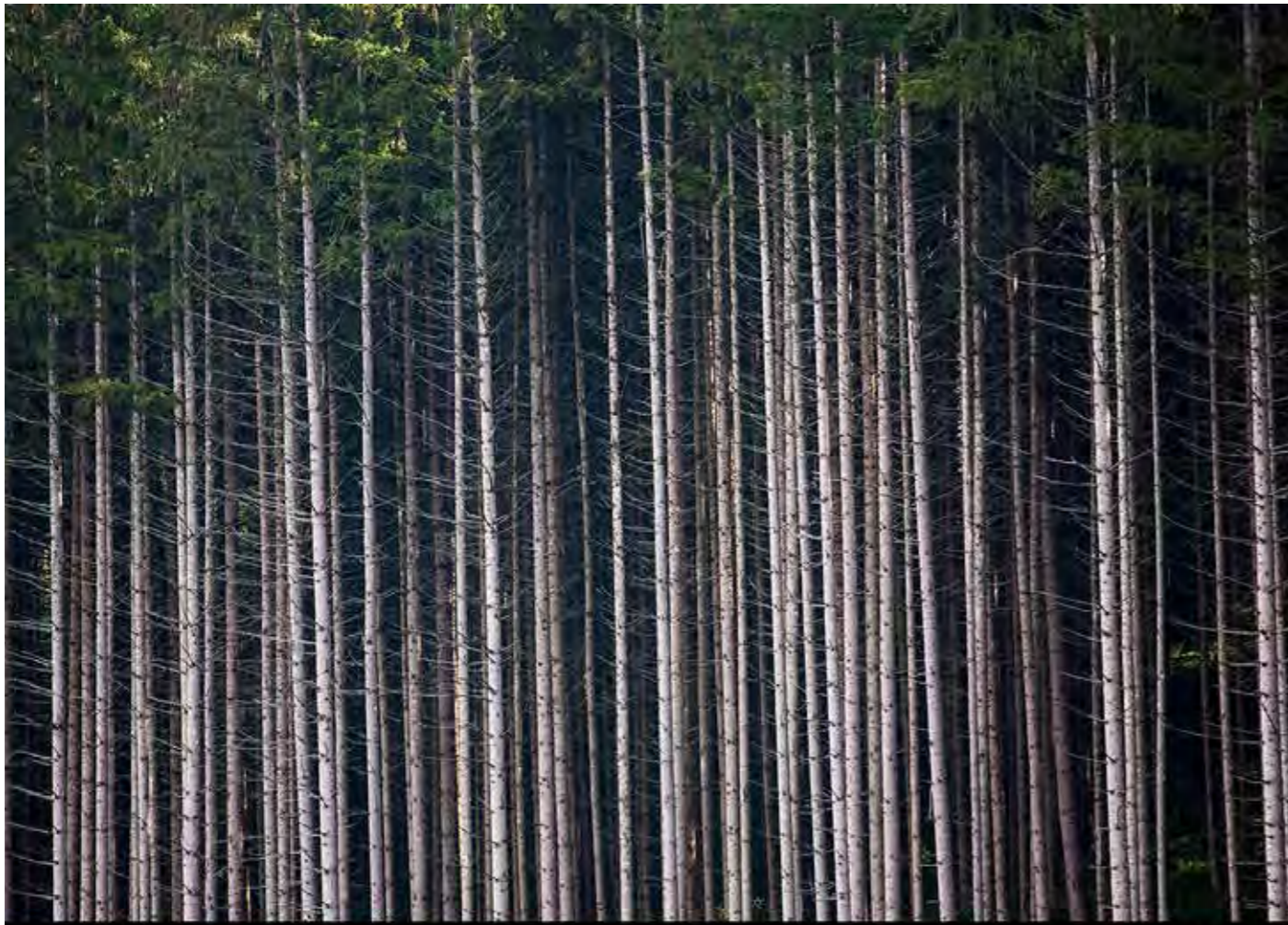
TYCH: FOREST GESAUSE PARK AUSTRIA AND MACRO OF A COAST OF A SECOND HAND RUSSIAN BO