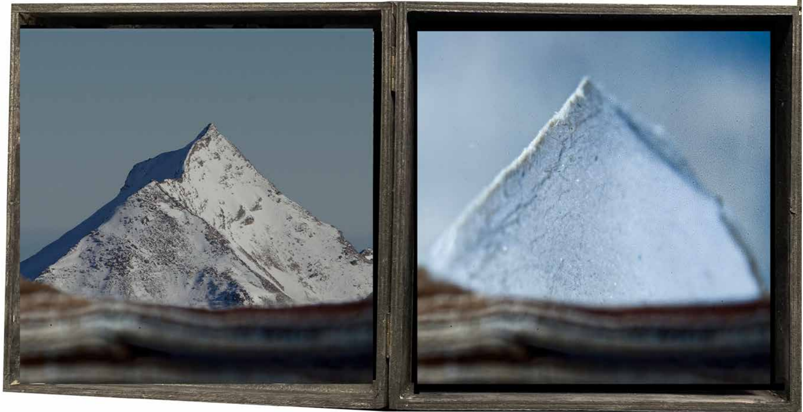
Montagne in scatola dittico montagna reale a Saas Fess a sx e a dx 12 mm di libro consumato (da Montagne di pagine mia exh)