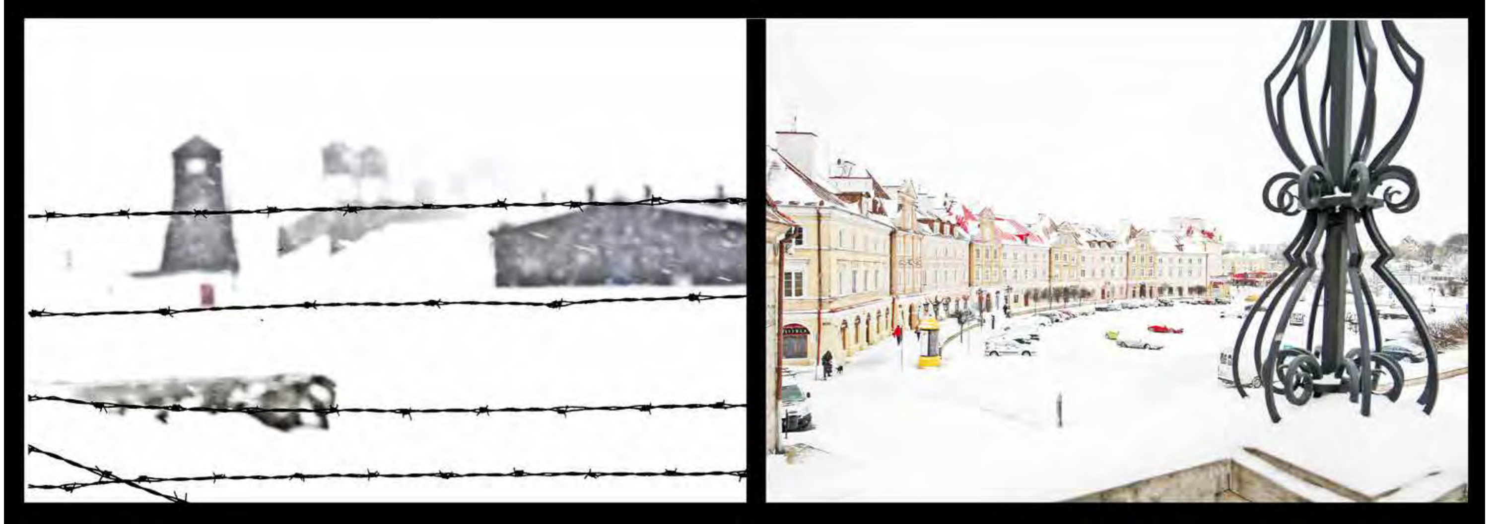
Poland, Lublin Maidanek + Castle Square 2018