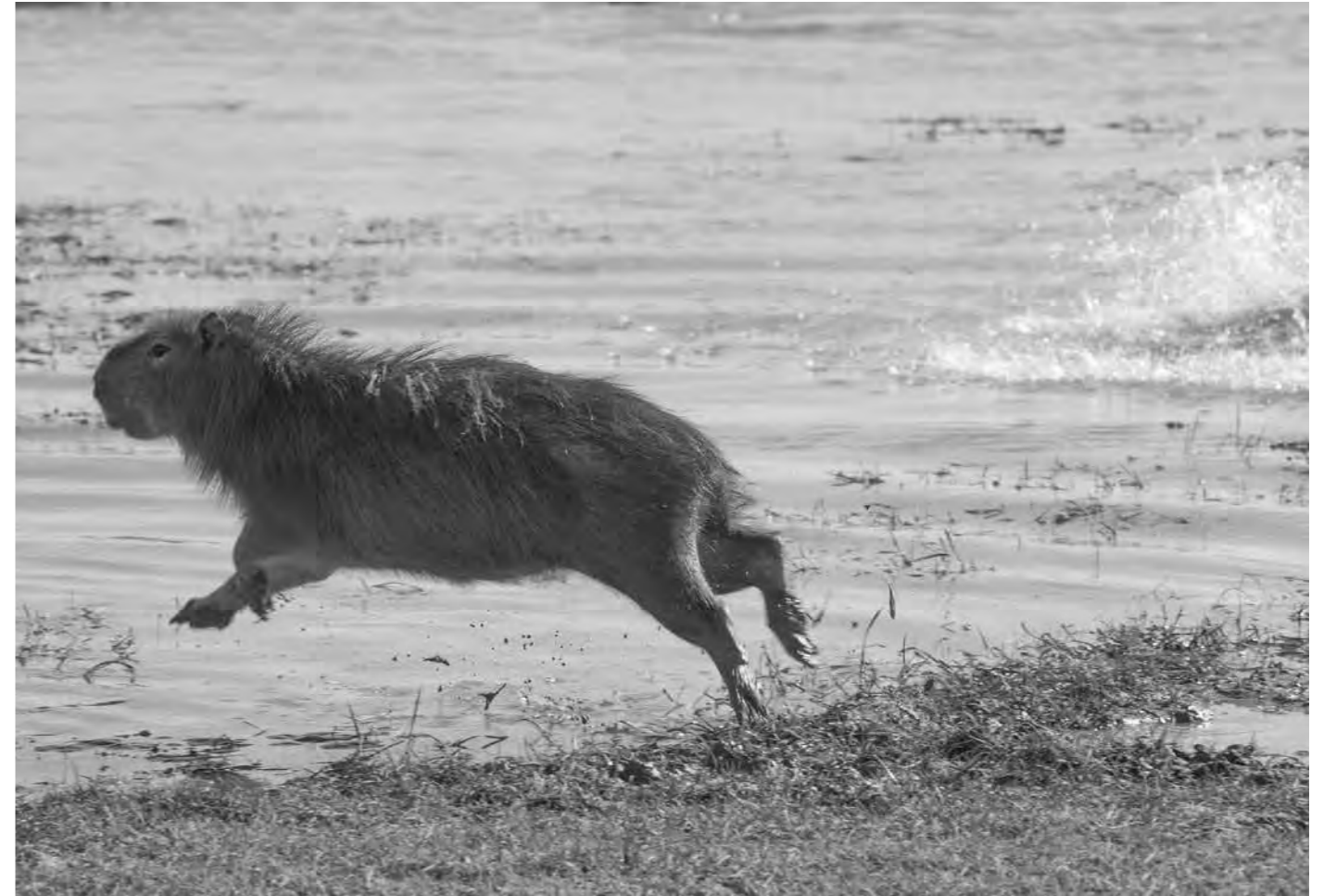
Argentina, Corrientes, Carpinchos 2010-2019